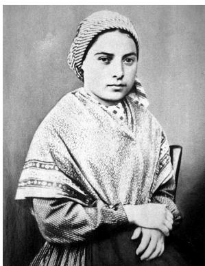
Benadette Soubirous, circa 1858

When Bernadette ran from the grotto and told her priest what Mary had said, Father knew exactly what this meant.