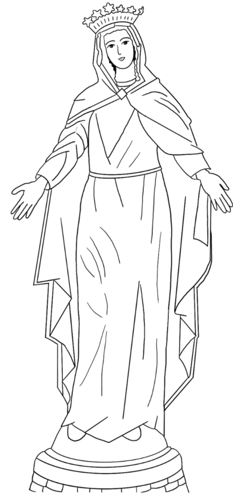
Our Lady of Lebanon

You are blest in heaven and on earth, O Mary. Mother of our Lord and God, we sing your praises. Alleluia! Give thanks to the Lord!