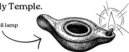
Ancient oil lamp

Because King Antiochus and his people did bad things in the Temple, the Jewish people now had to purify it and make it clean once again. Maccabees and his companions destroyed all the idols and made a new altar for the Temple. They offered sacrifices to the Lord, burned incense and lit their oil lamps. For eight days the Jewish people celebrated joyfully as they were able once again to worship the Lord God in their holy Temple.